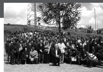
90 Ugandan pastors on Alpha Training "Graduation Day"

In January 2013, Truro sent a Global Alpha Training (GAT) team to the Diocese of Kigezi in Kampala, Uganda. We recently heard from Uganda's Alpha Director, who shares a very encouraging update: